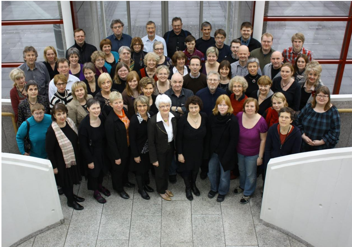
The Library staff on 6 May 2010.

National and University Library of Iceland: ANNUAL REPORT 2009.