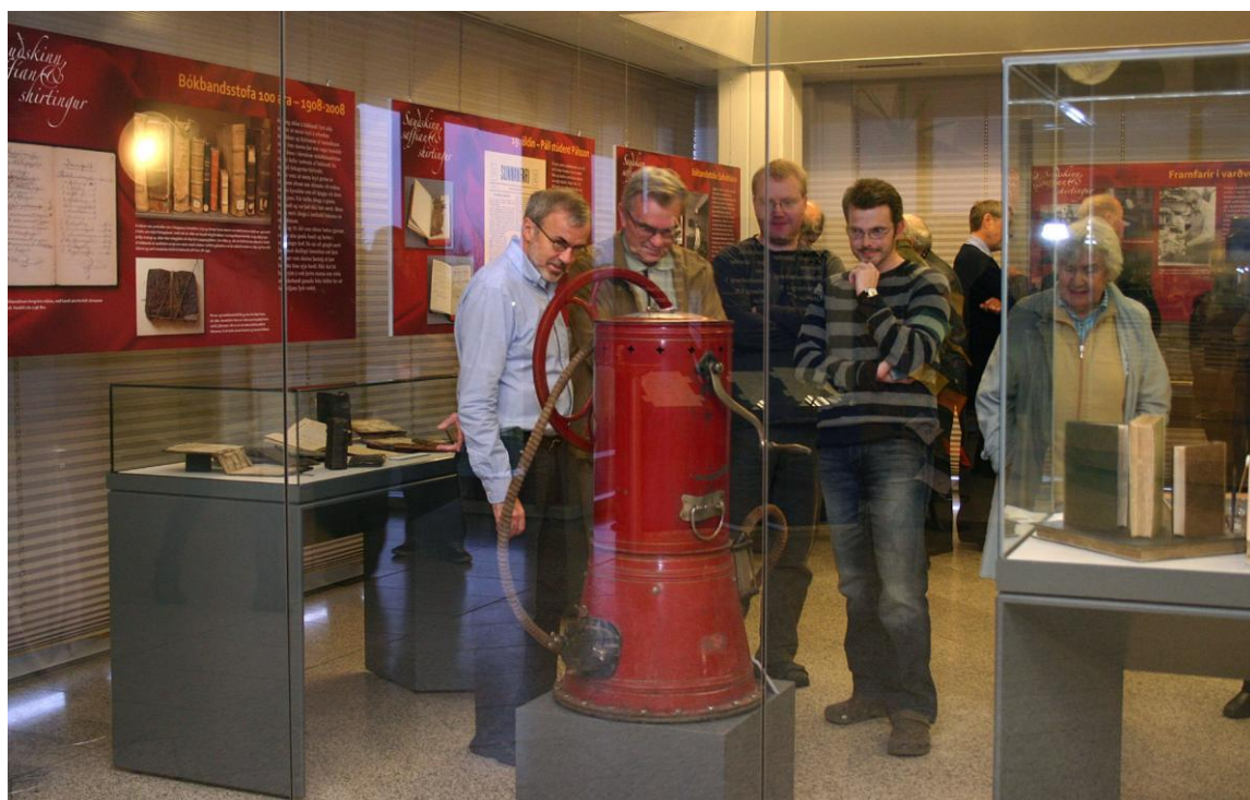
The Library's first book vacuum cleaner, which was on view in an exhibition marking the Library's 100 th anniversary.